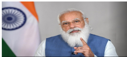
Prime Minister, Shri Narendra Modi virtually addressing at the inaugural session of Raisina Dialogue

PM Modi delivered a video address on 13 April 2021 at the Inaugural Session of the Raisina Dialogue in virtual format, along with Chief Guests H.E. Paul Kagame, President of Rwanda and H.E. Mette Frederiksen, Prime Minister of Denmark. The Raisina Dialogue is India's premier conference on geopolitics and geo-economics committed to addressing the most challenging issues facing the global community. More details can be found on https://www.orfonline.org/raisina-dialogue/ .